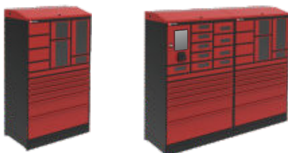
Standard drawers configurations